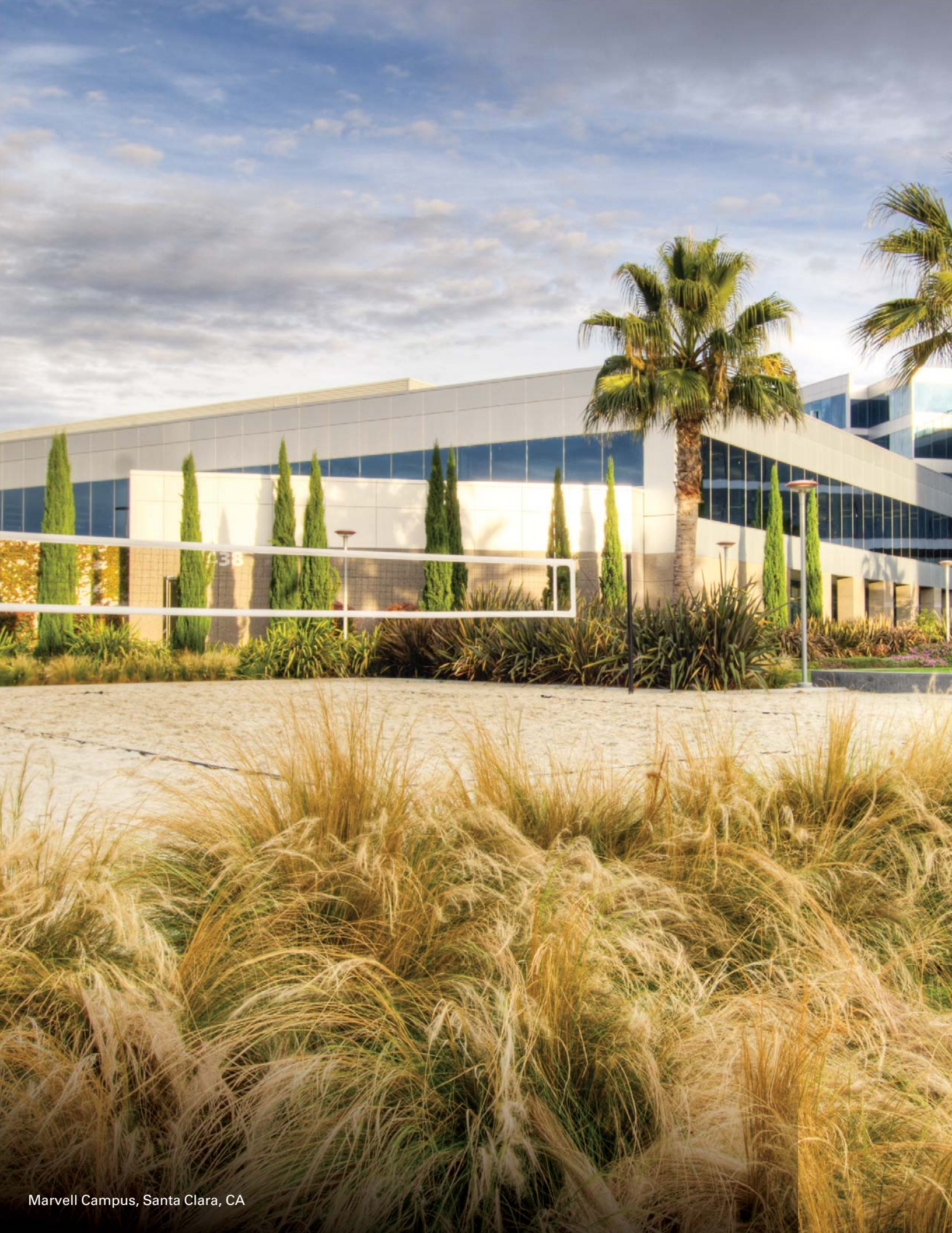
Marvell Campus, Santa Clara, CA