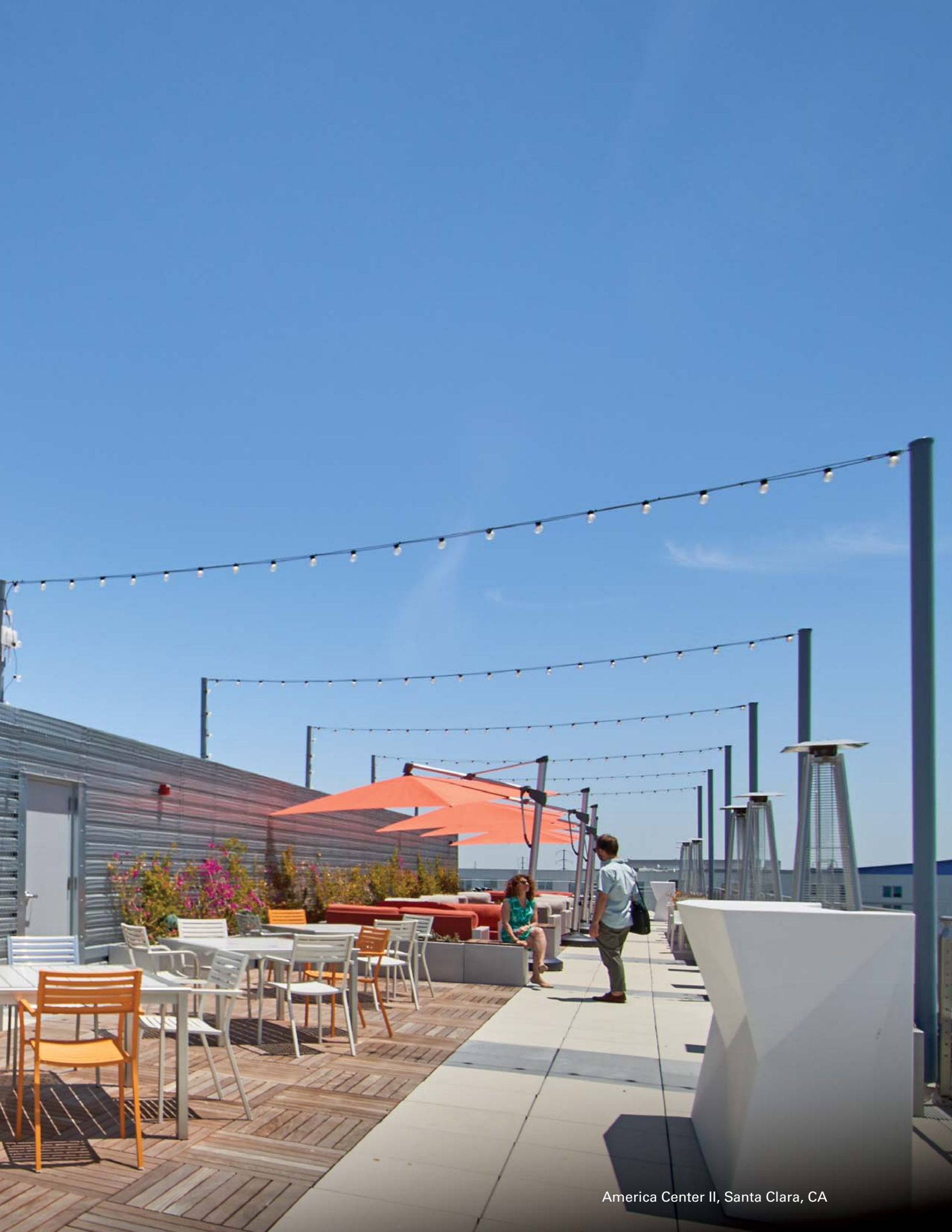
America Center II, Santa Clara, CA