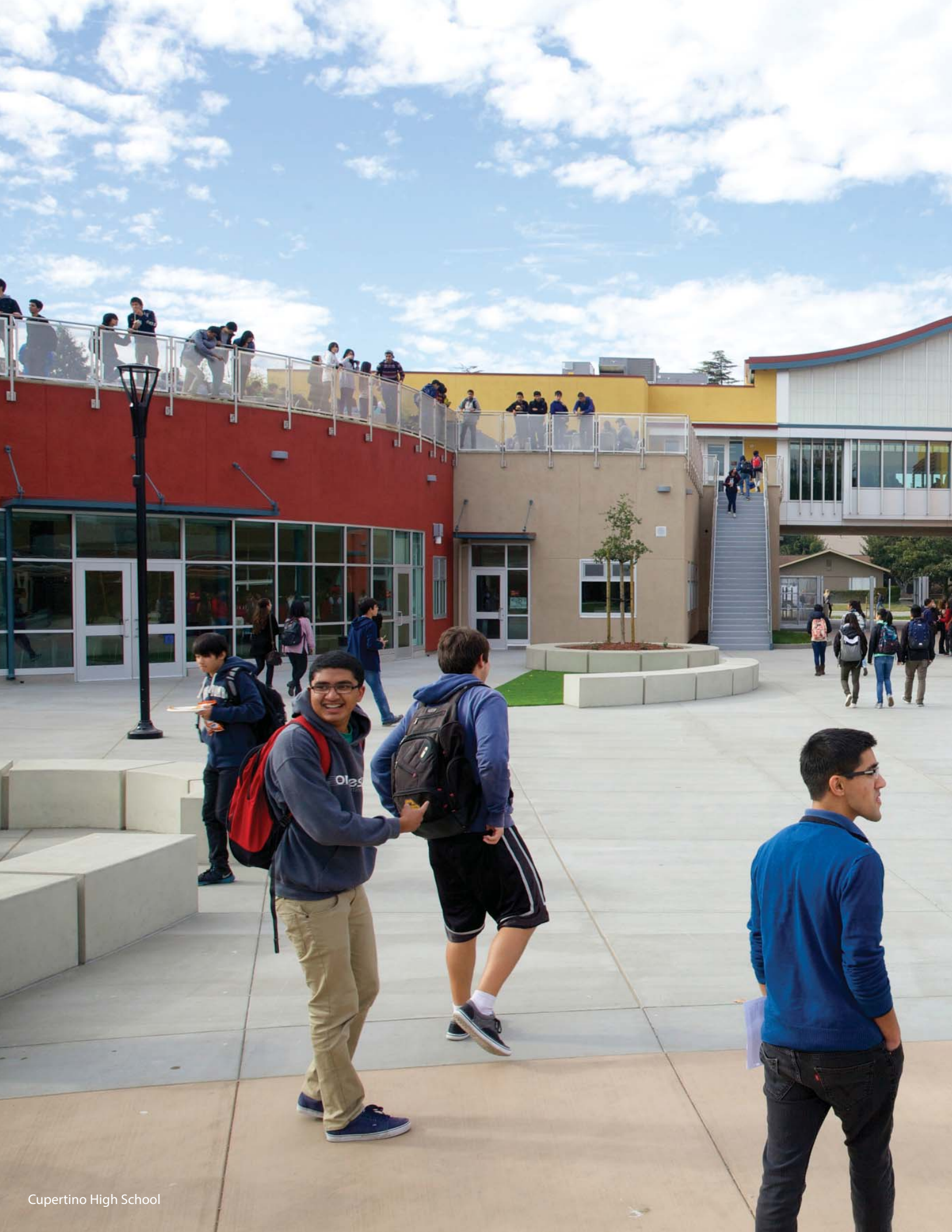
Cupertino High School