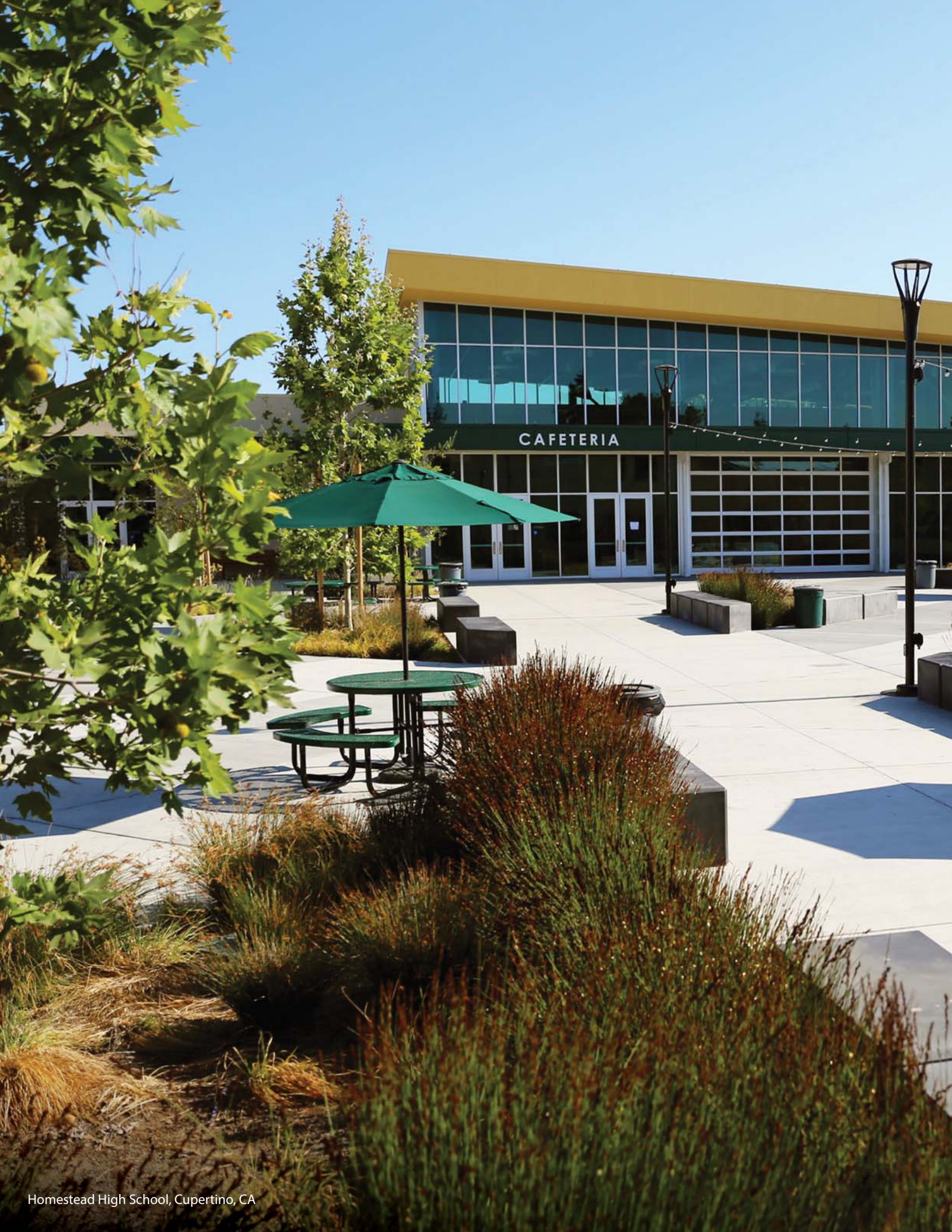
Homestead High School, Cupertino, CA