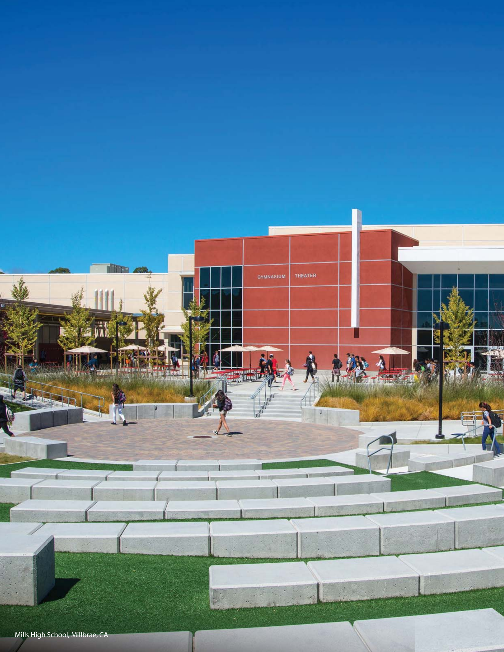
Mills High School, Millbrae, CA