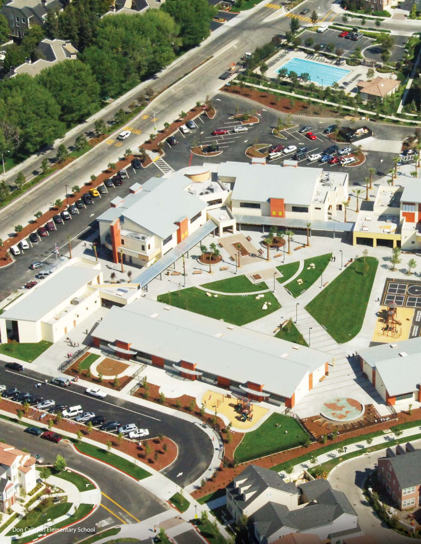
Don Callison Elementary School