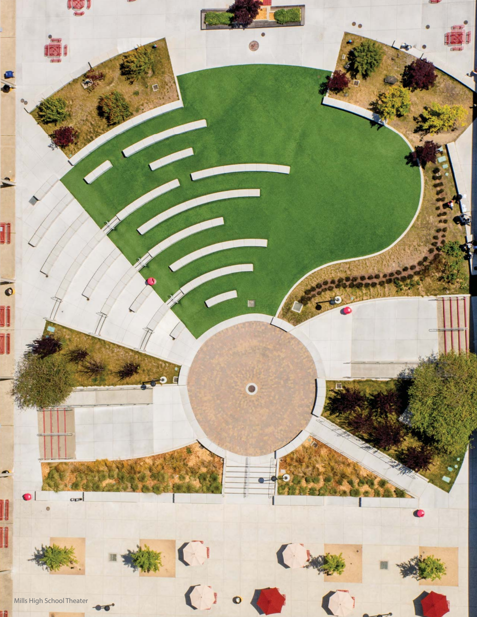
Mills High School Theater