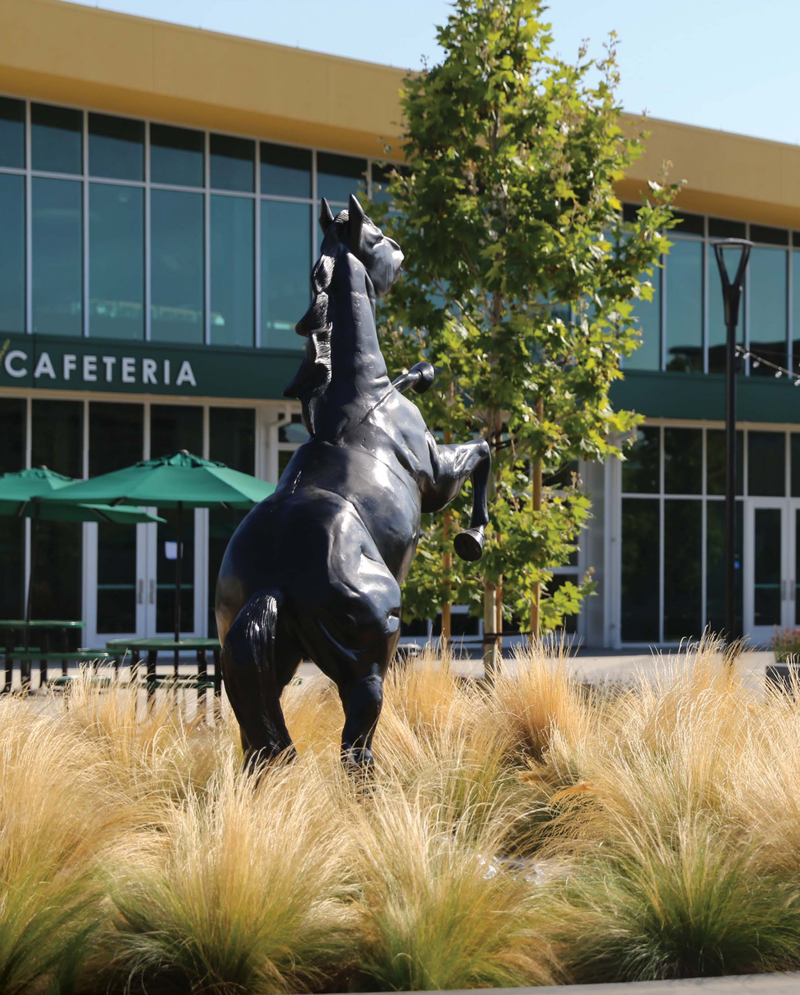
Homestead High School