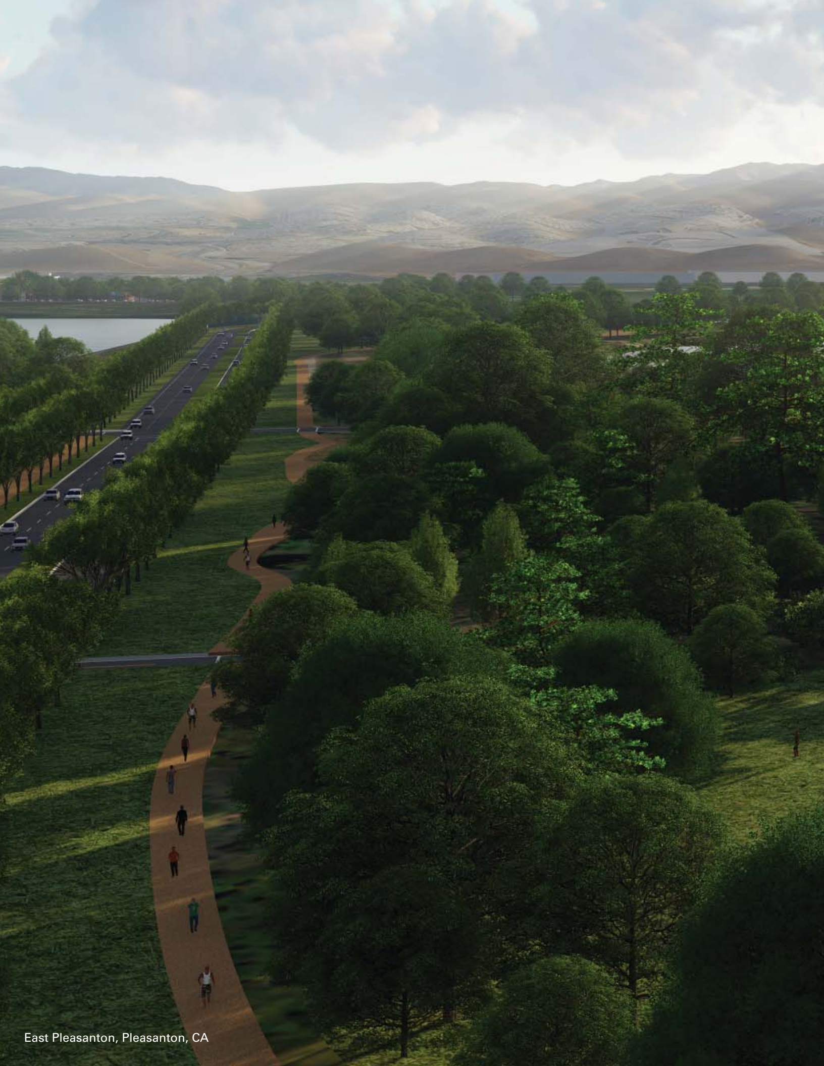
East Pleasanton, Pleasanton, CA