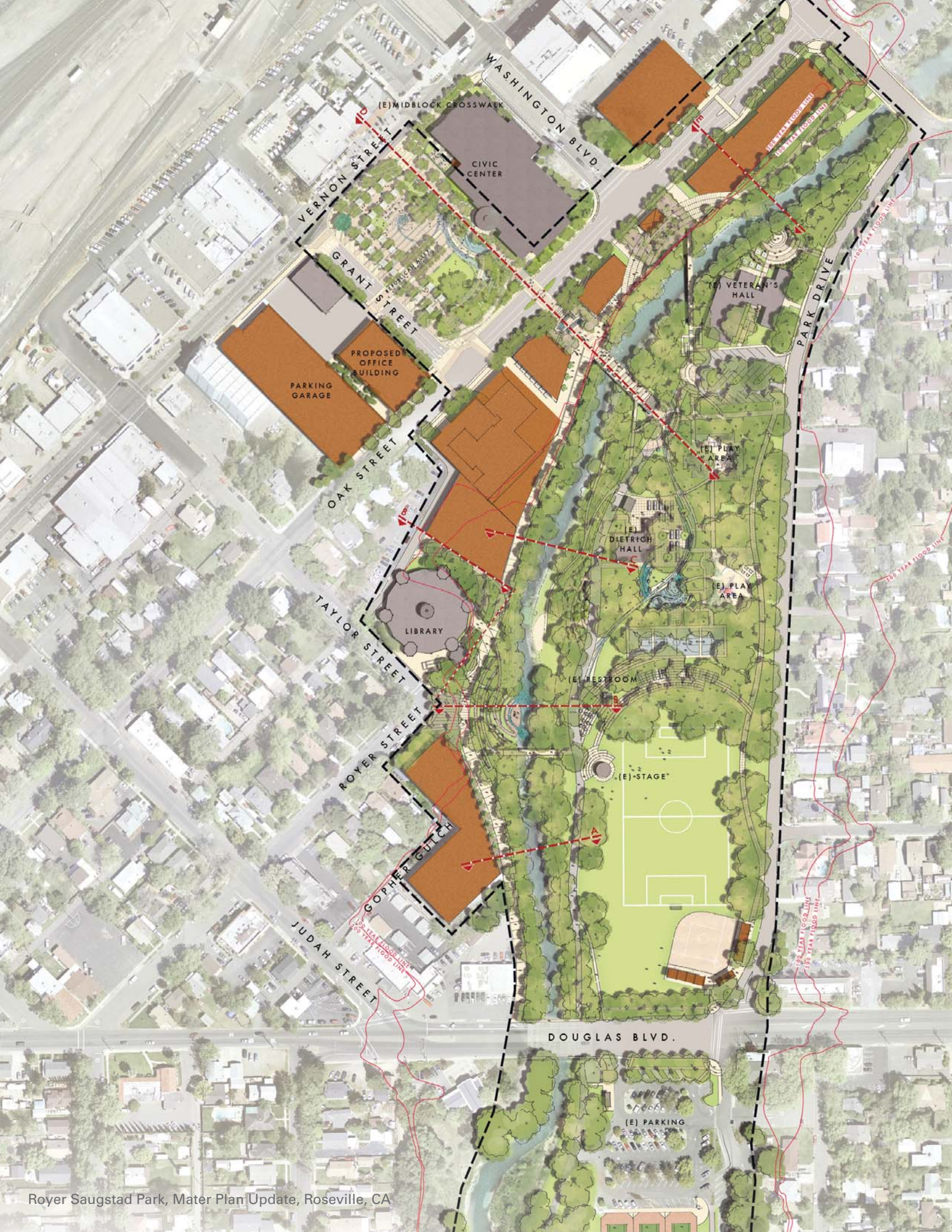
Royer Saugstad Park, Mater Plan Update, Roseville, CA