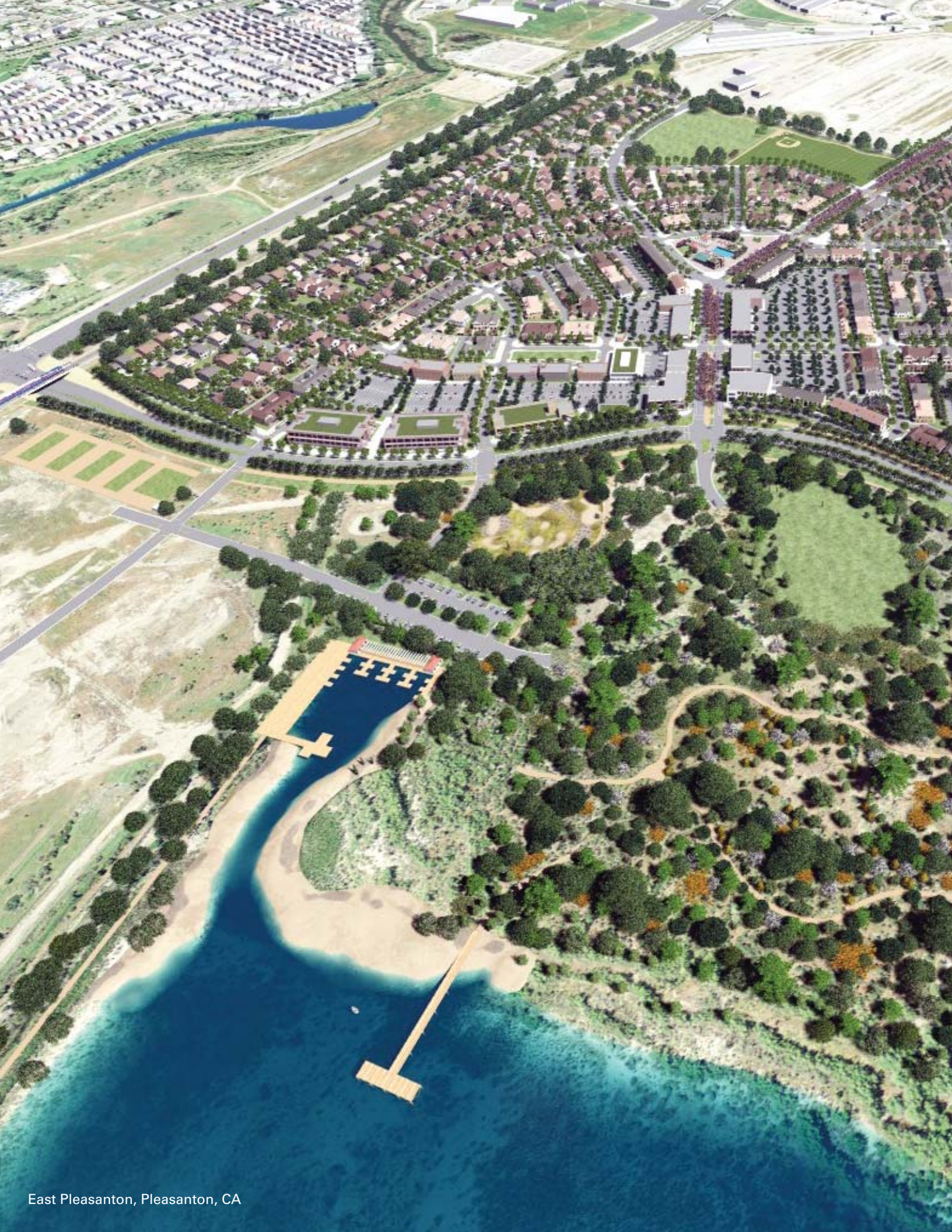
East Pleasanton, Pleasanton, CA