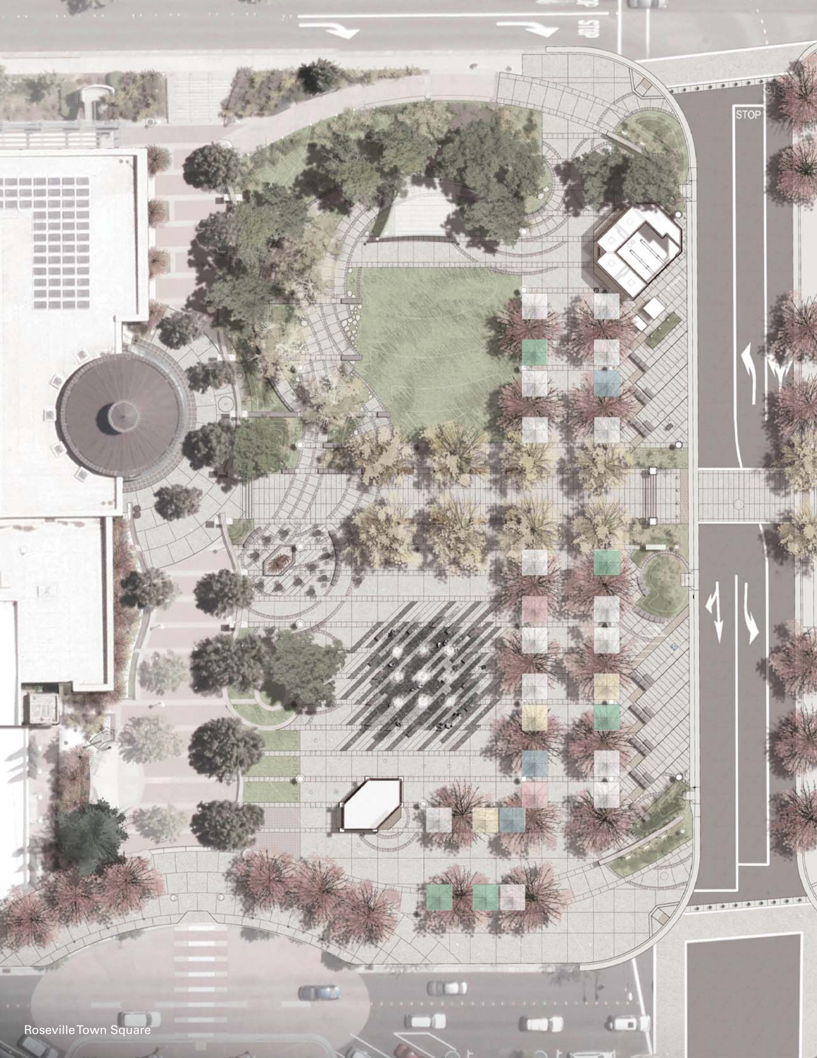
Roseville Town Square