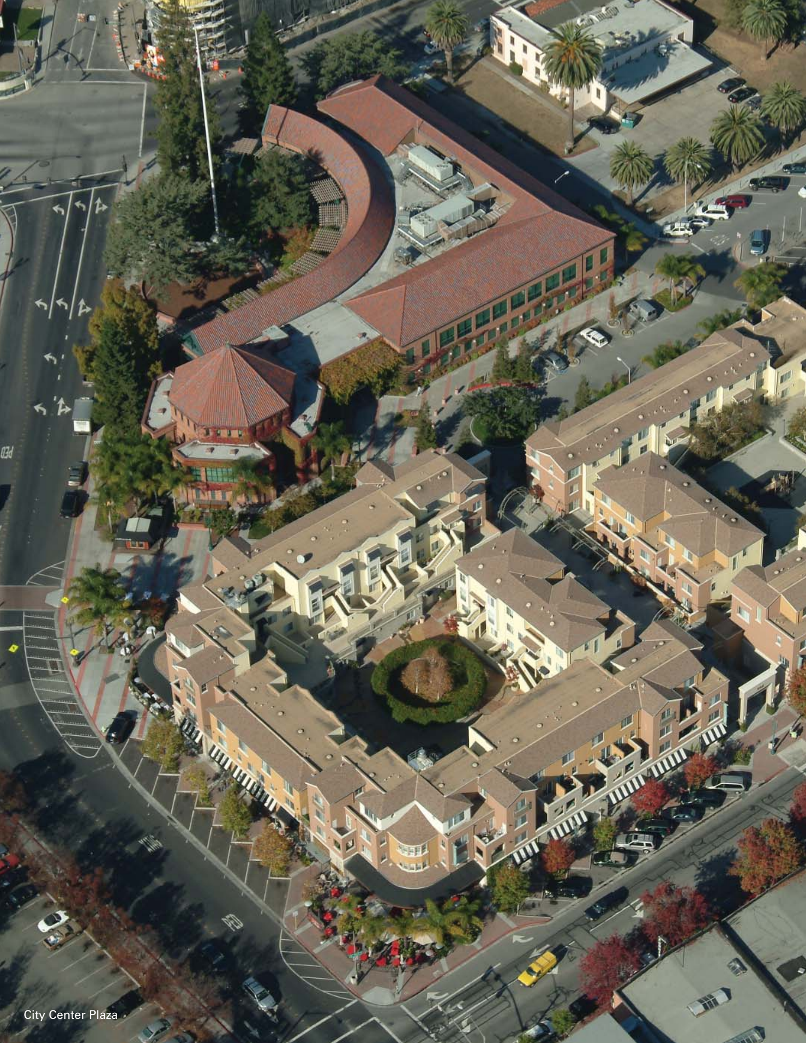
City Center Plaza