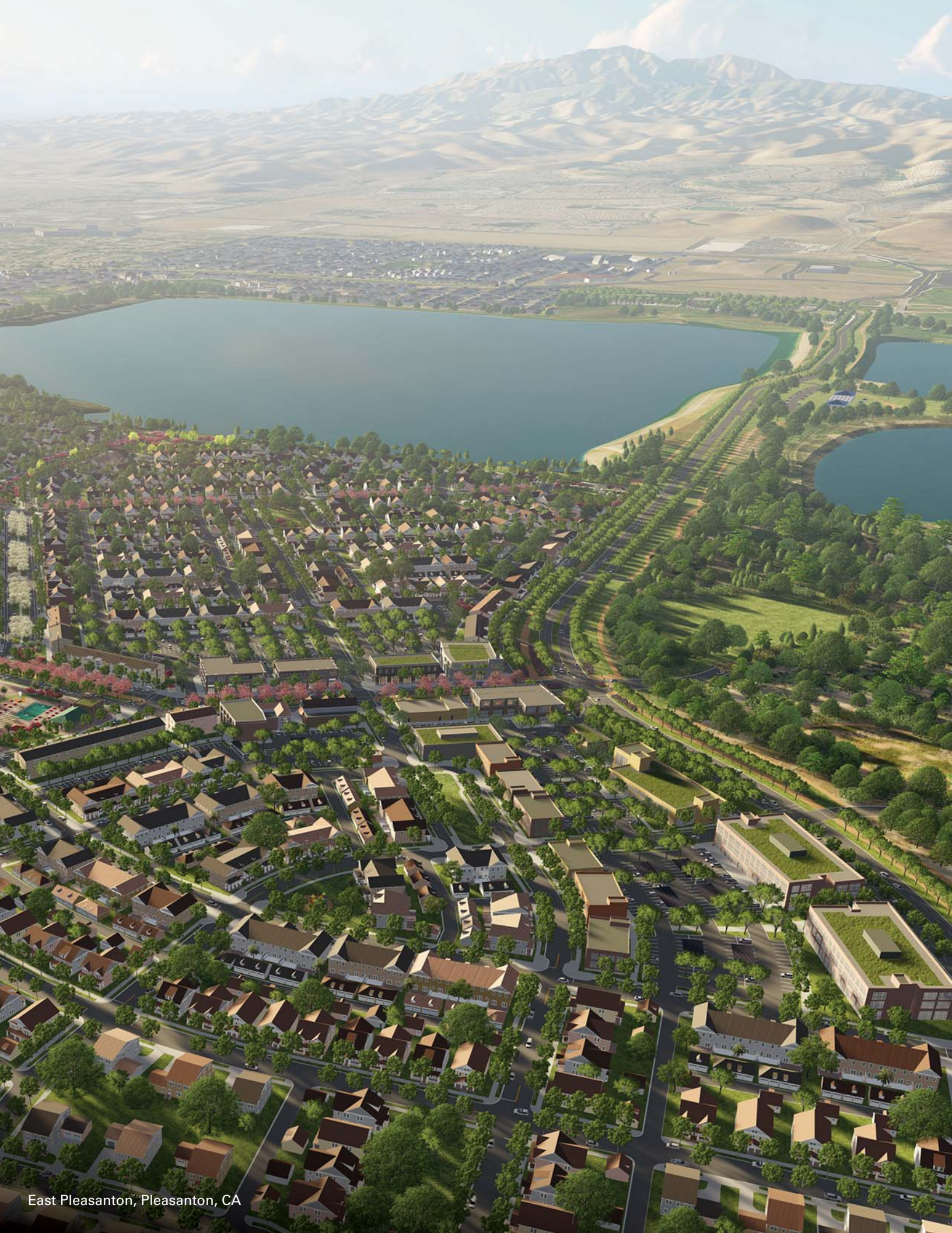
East Pleasanton, Pleasanton, CA