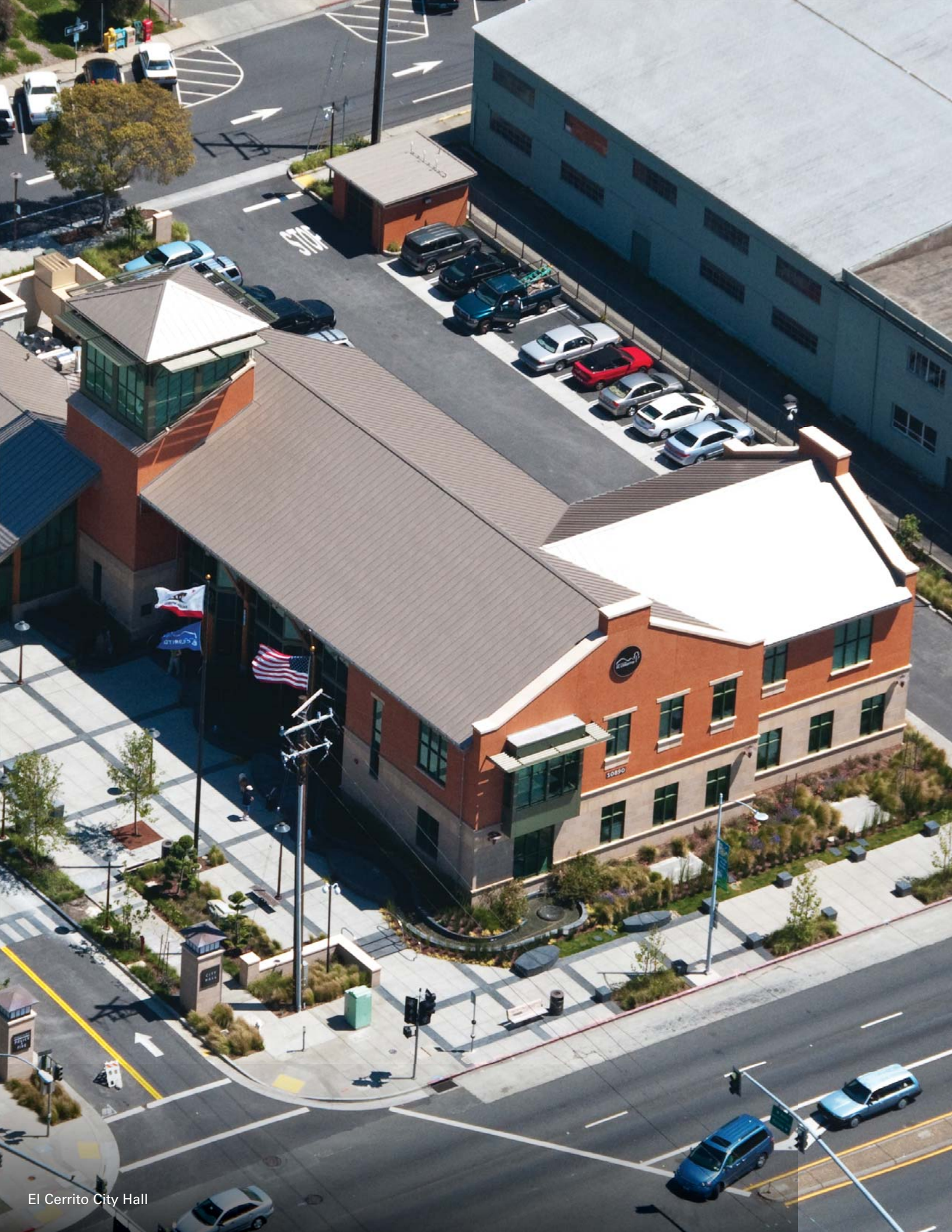
El Cerrito City Hall