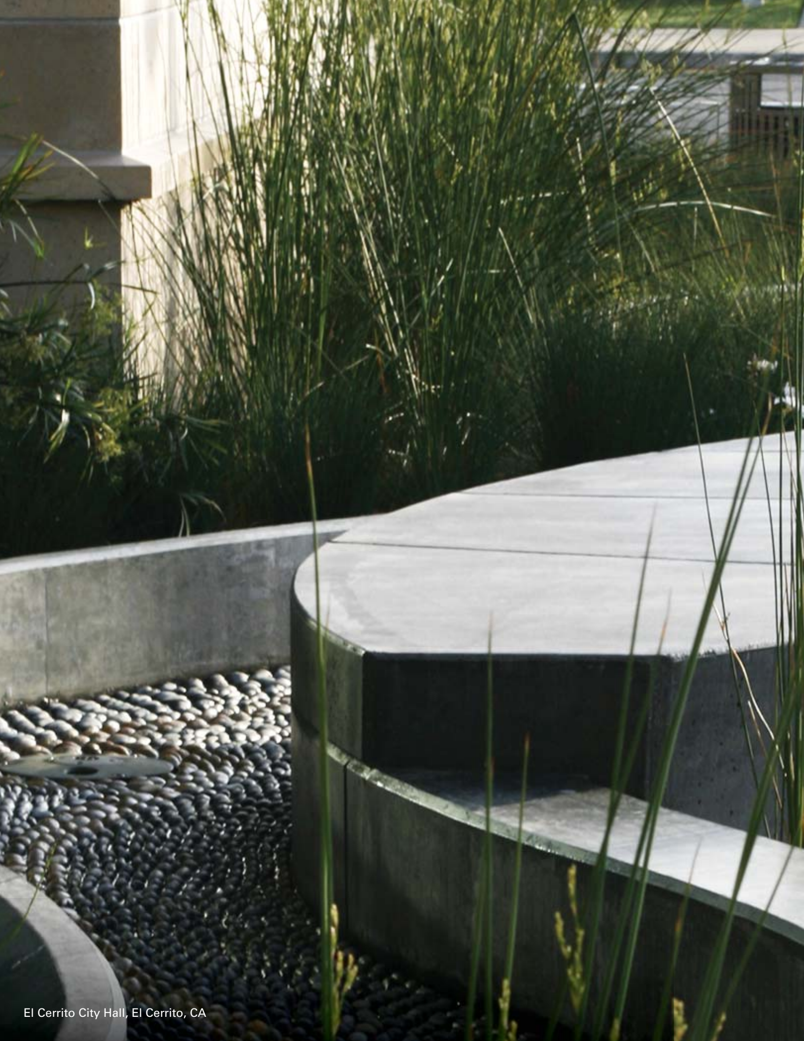
El Cerrito City Hall, El Cerrito, CA