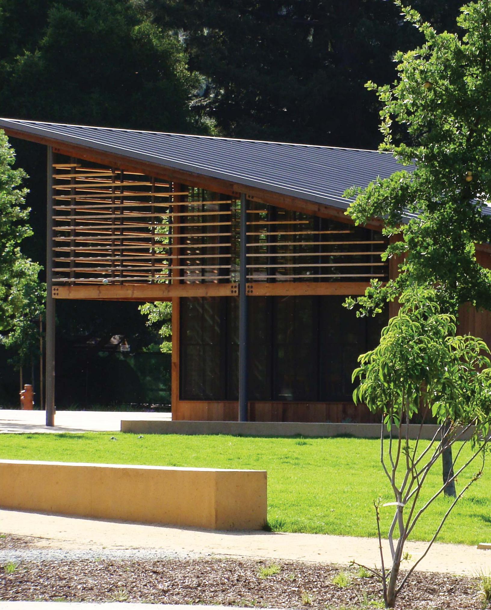
Portola Valley Town Center