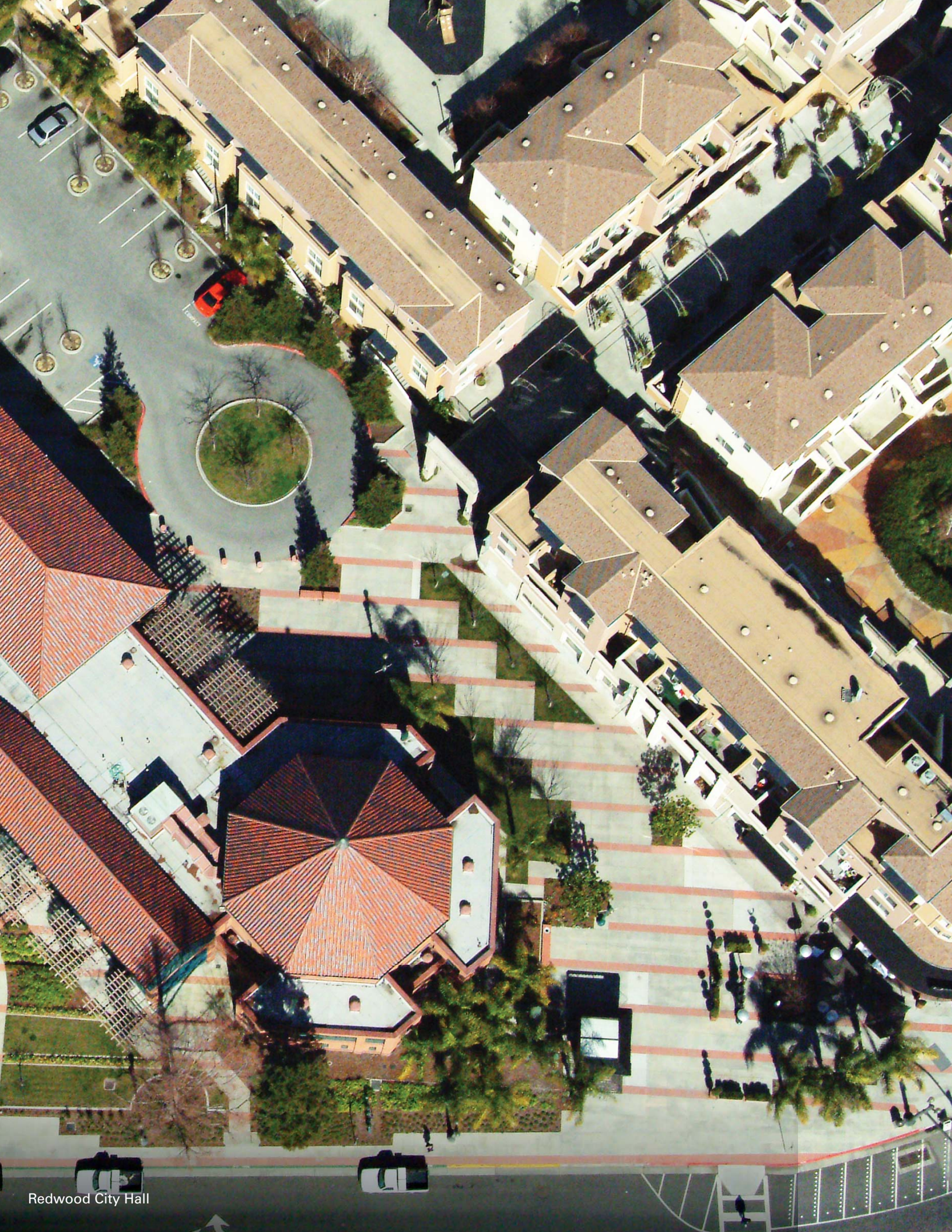
Redwood City Hall