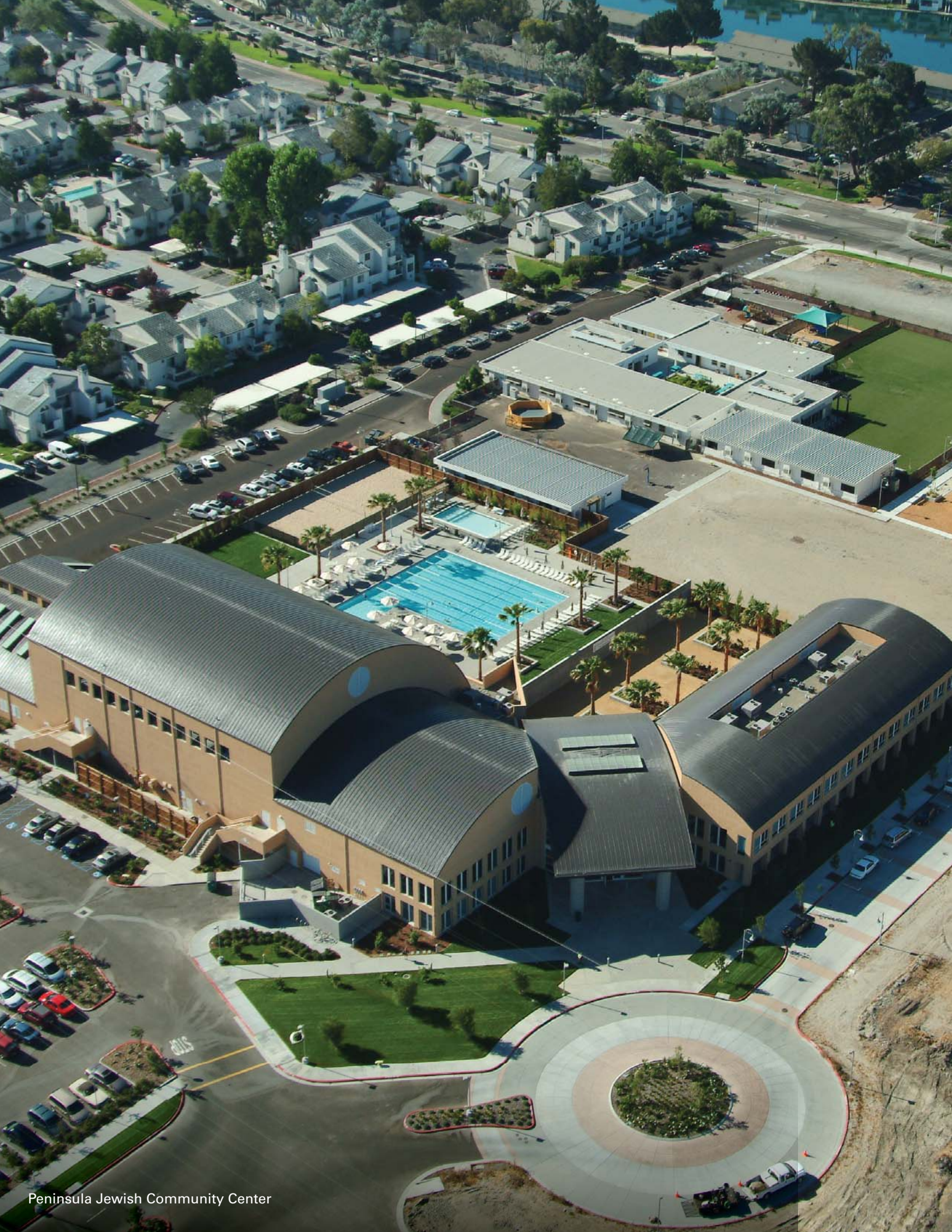
Peninsula Jewish Community Center