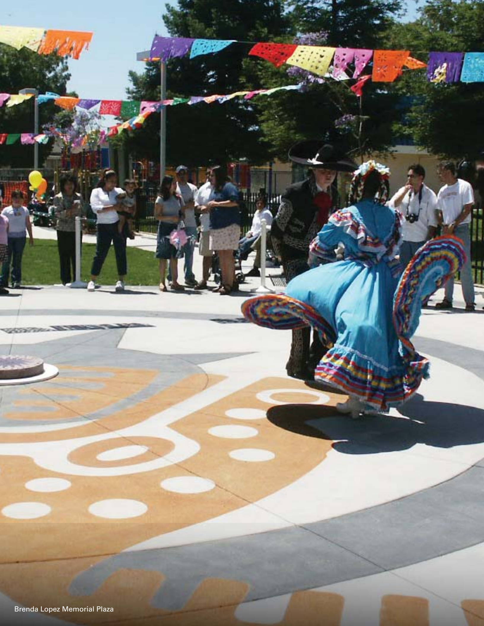
Brenda Lopez Memorial Plaza