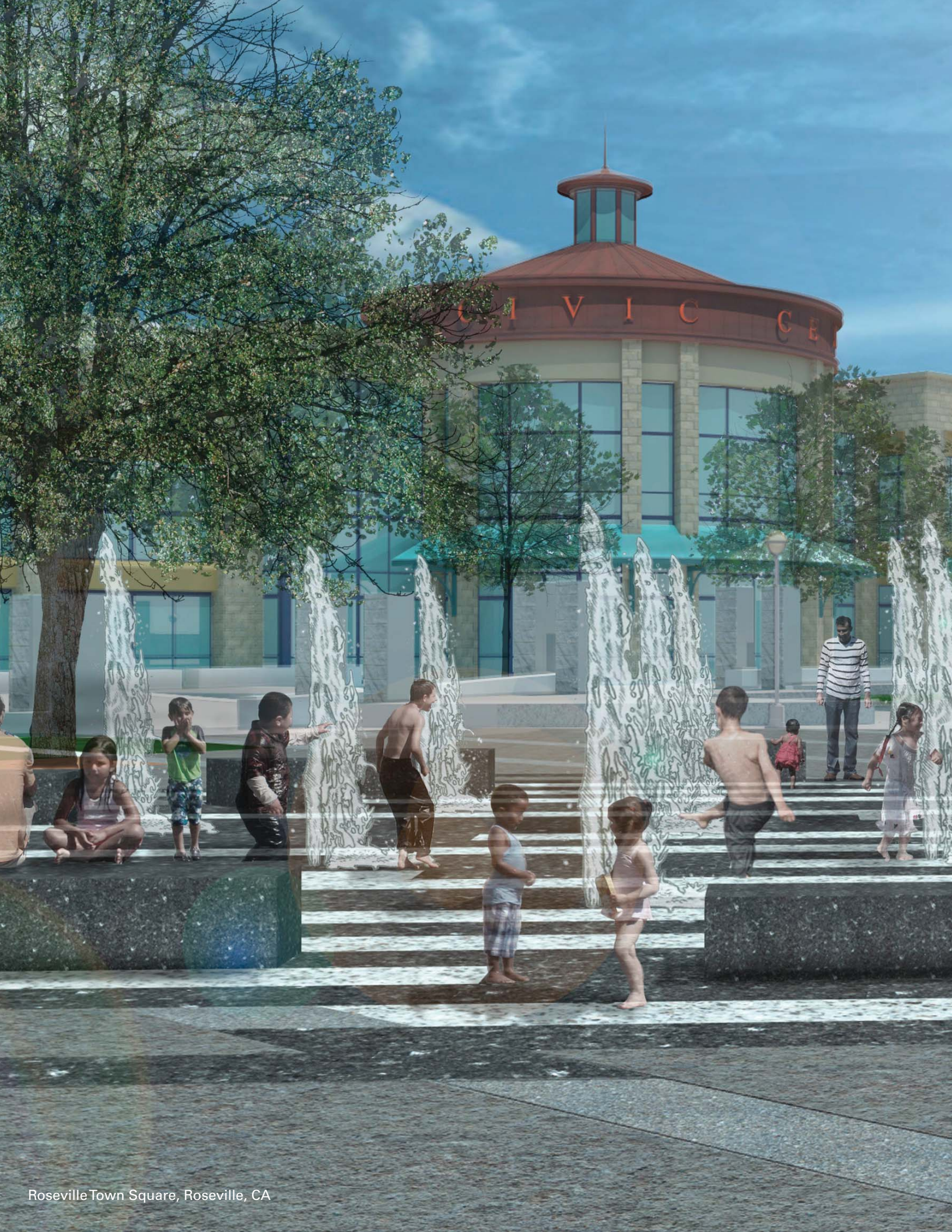
Roseville Town Square, Roseville, CA