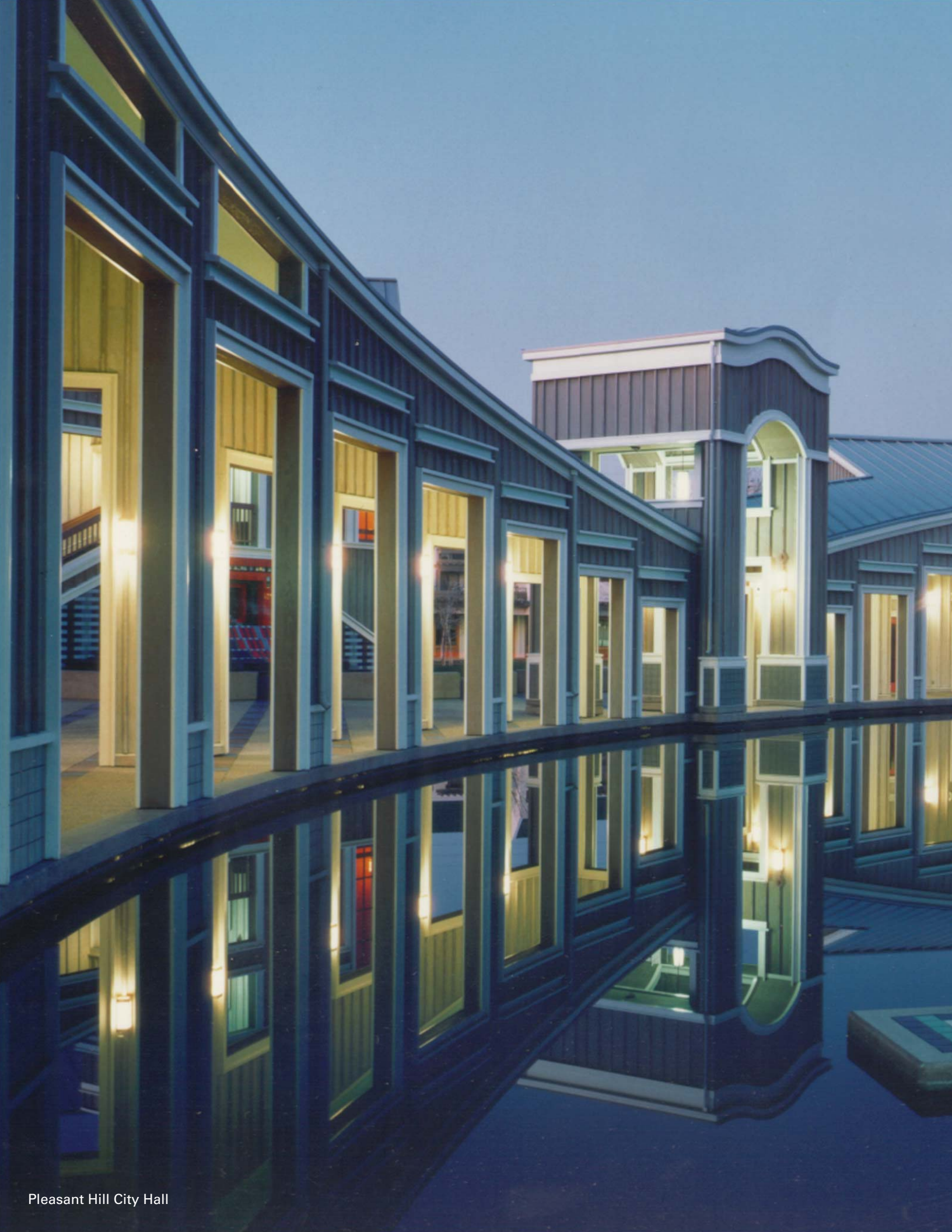
Pleasant Hill City Hall