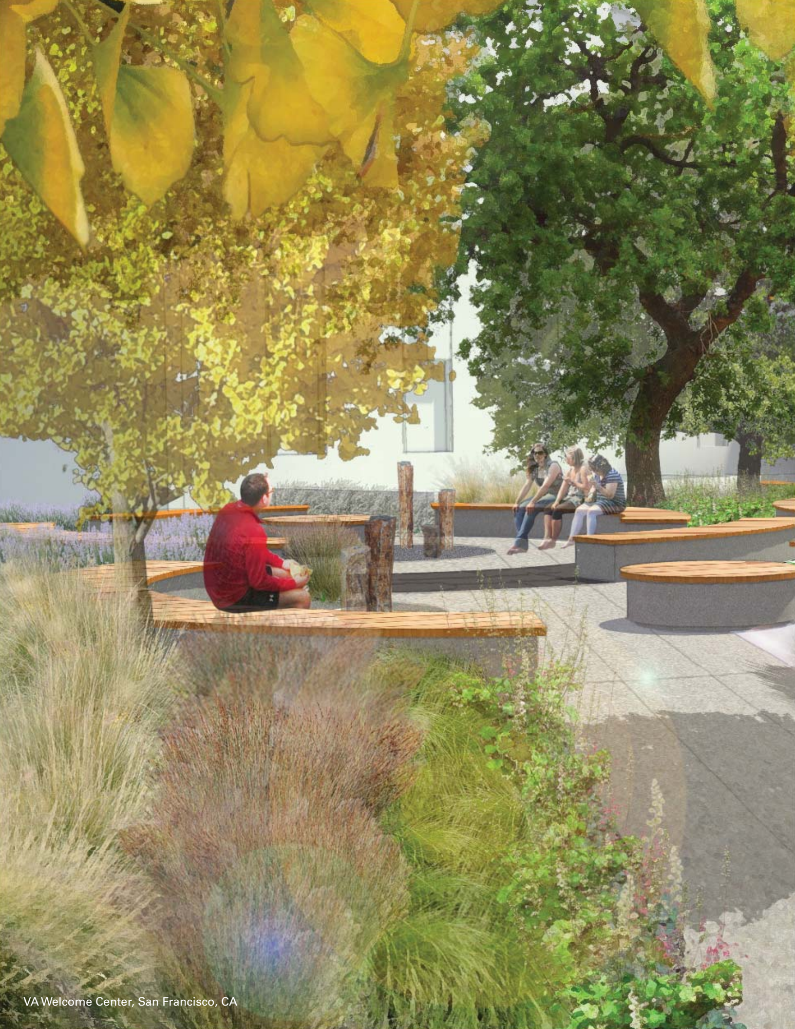
VA Welcome Center, San Francisco, CA