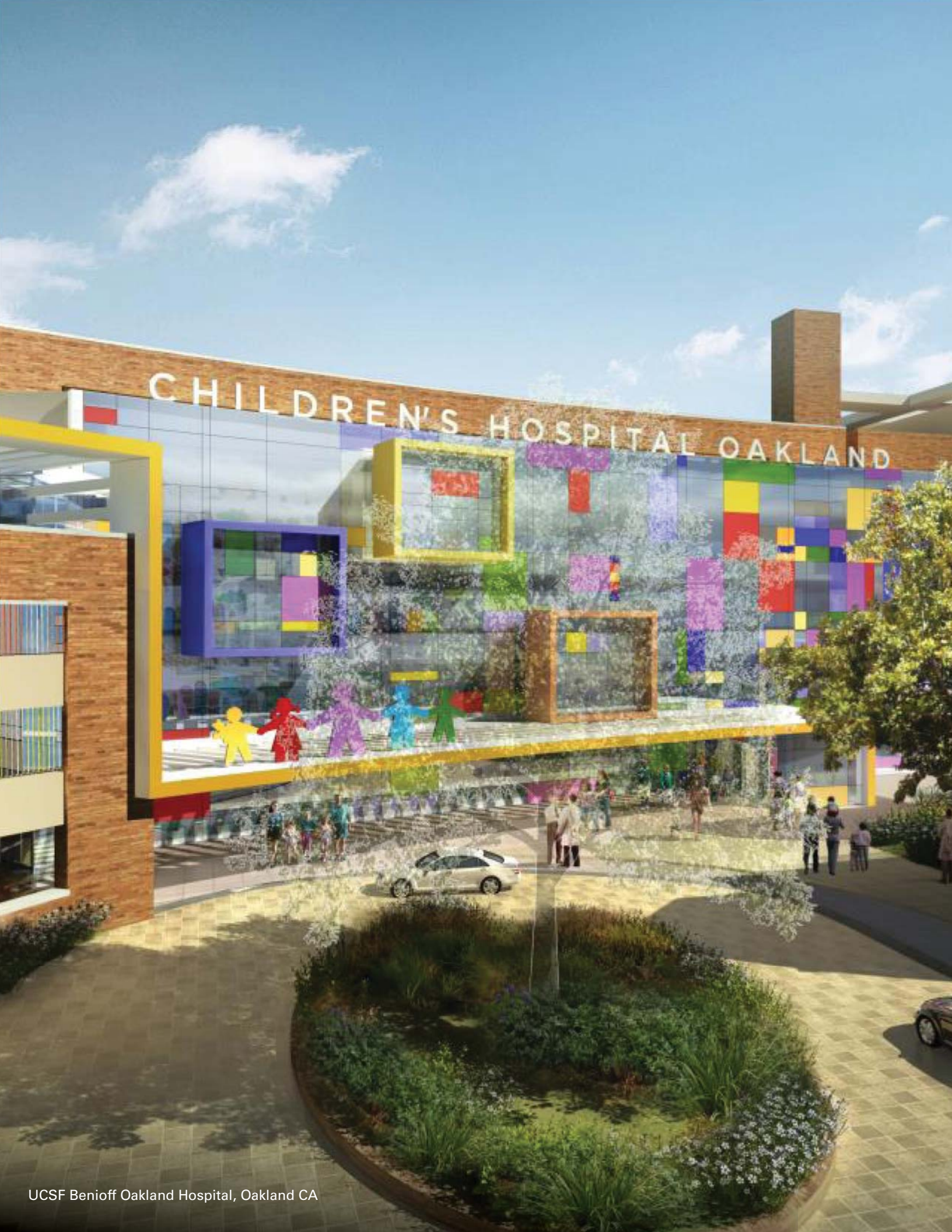
UCSF Benioff Oakland Hospital, Oakland CA