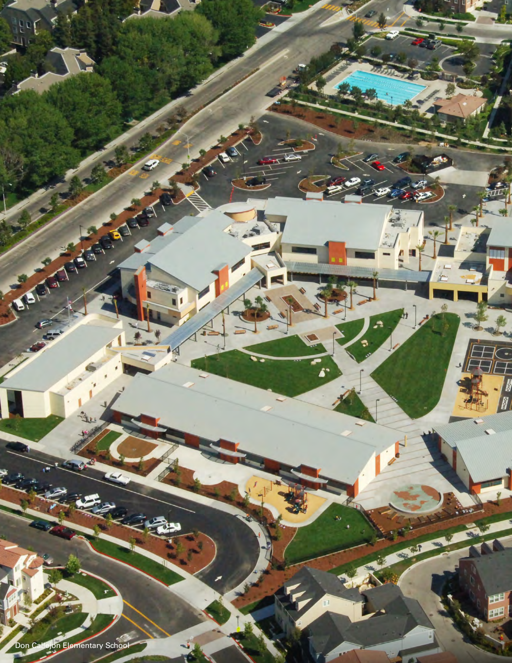
Don Callejon Elementary School