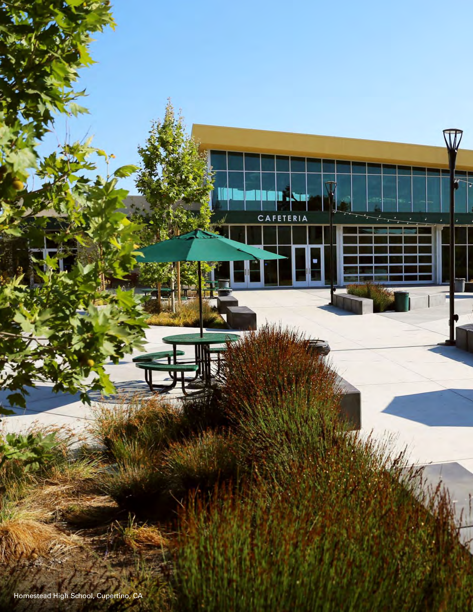
Homestead High School, Cupertino, CA