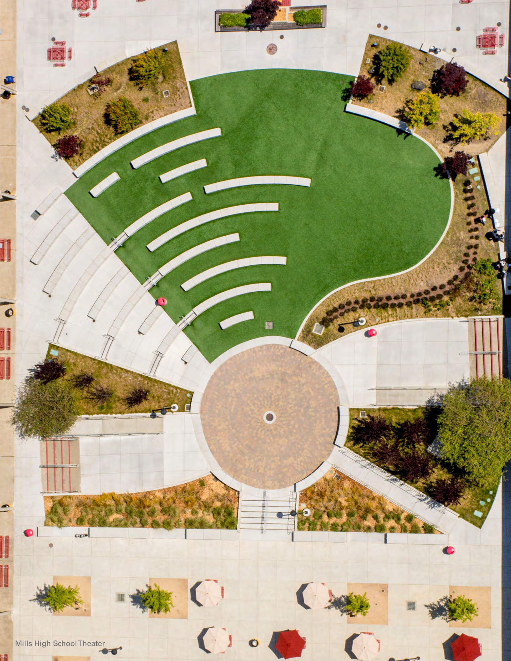
Mills High School Theater