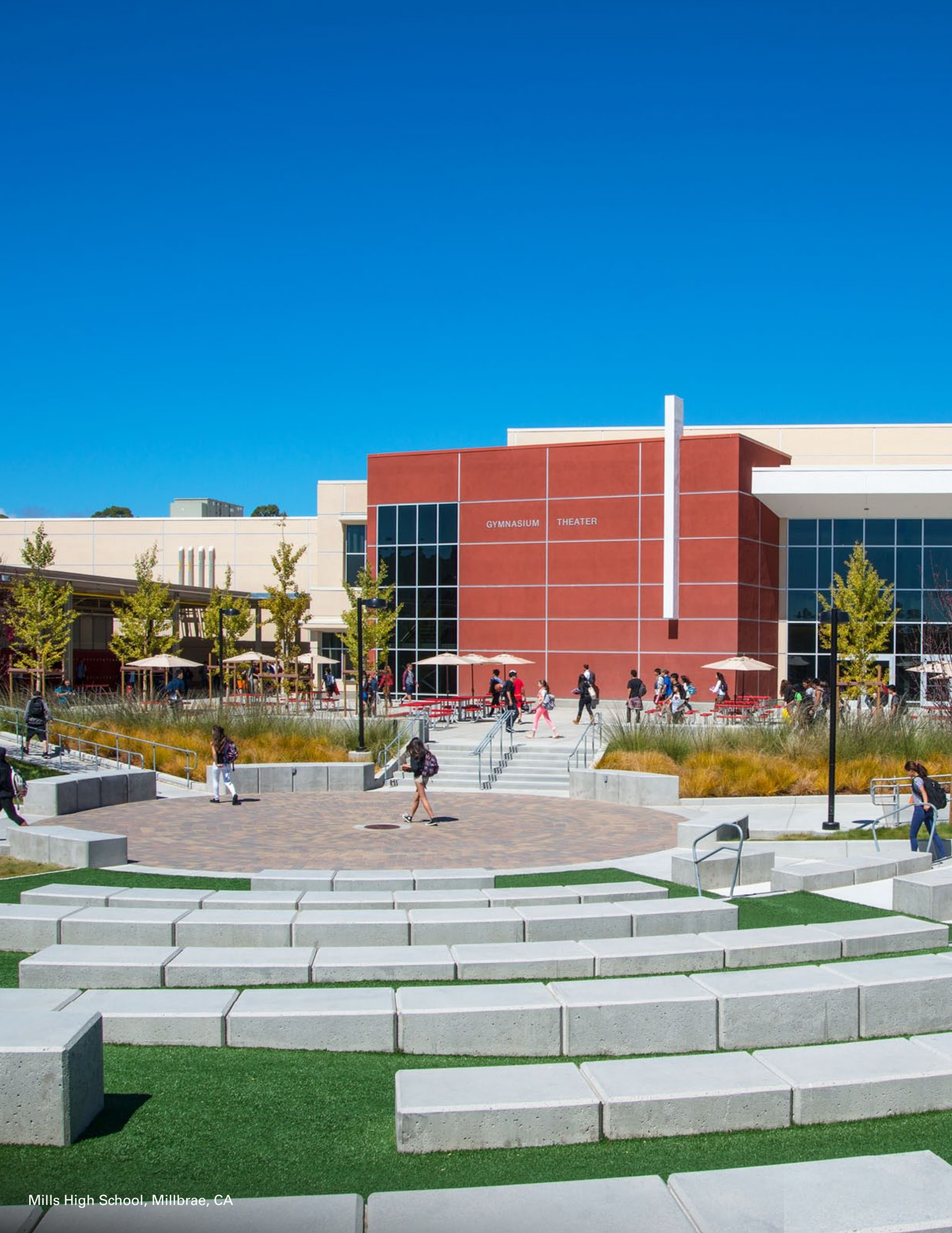
Mills High School, Millbrae, CA