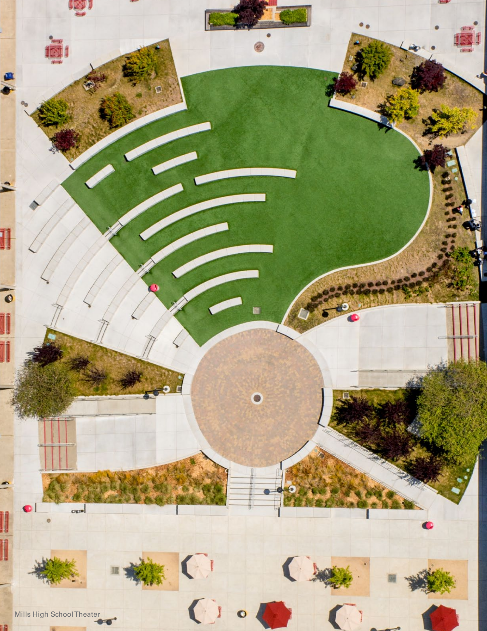
Mills High School Theater