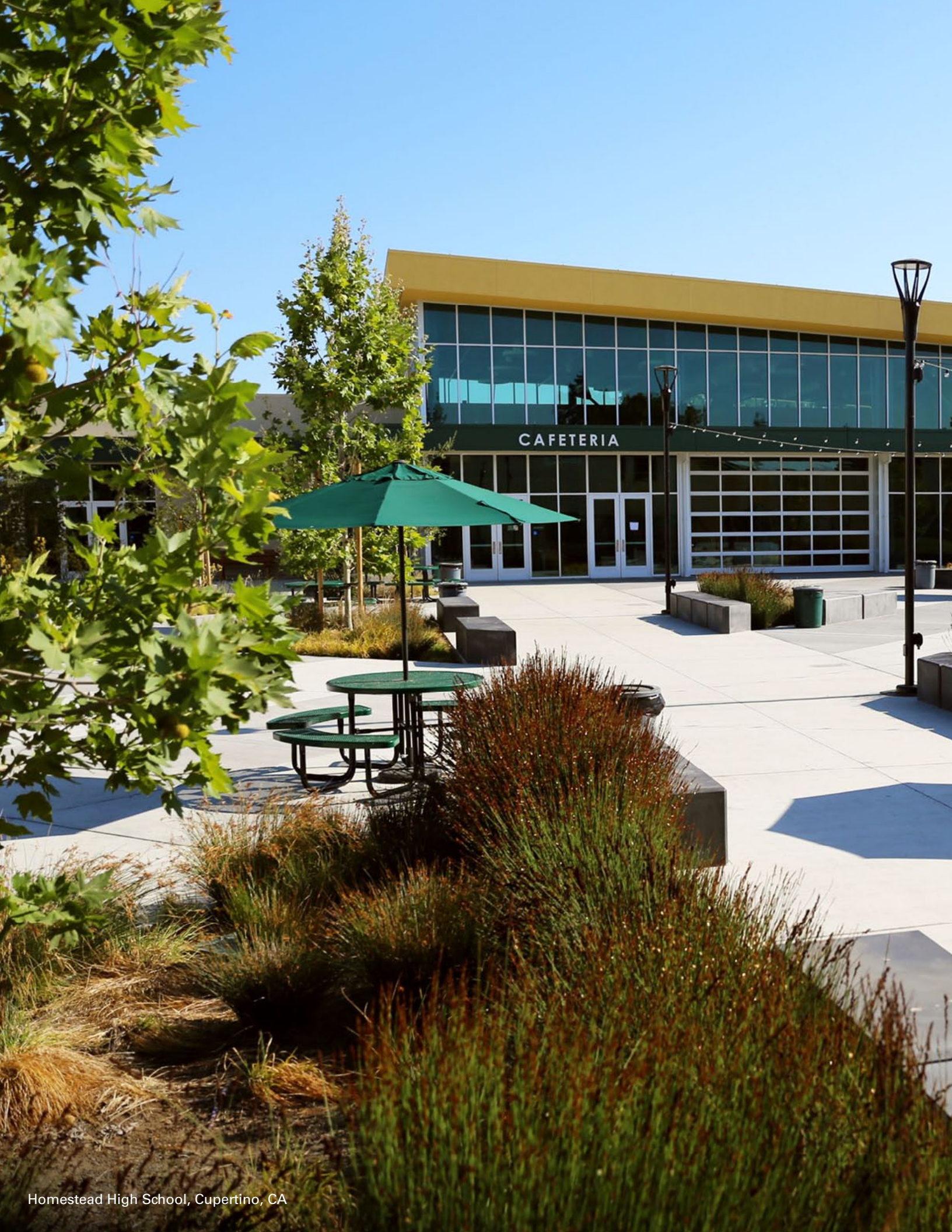
Homestead High School, Cupertino, CA