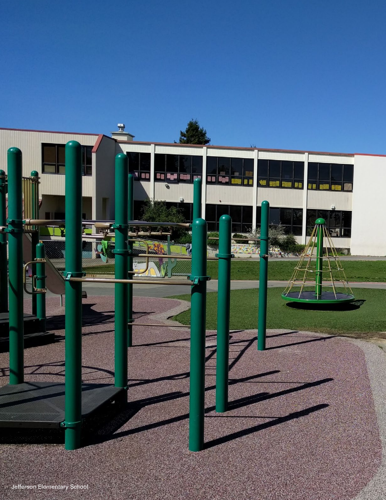
Jefferson Elementary School