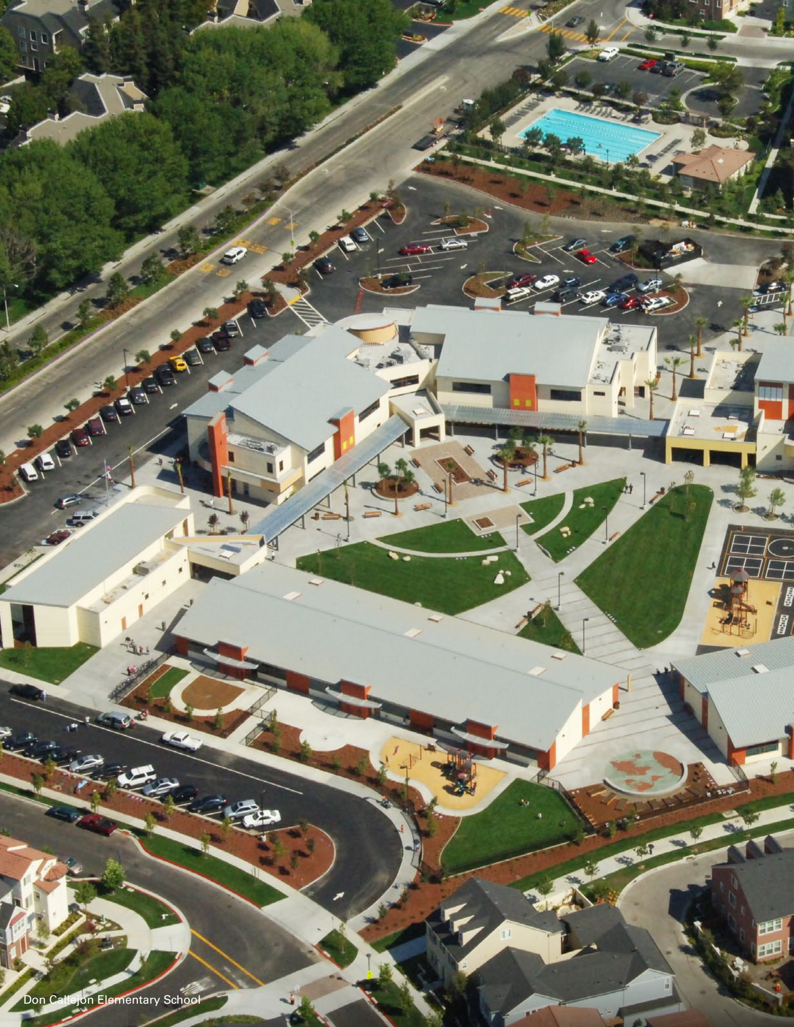
Don Callejon Elementary School